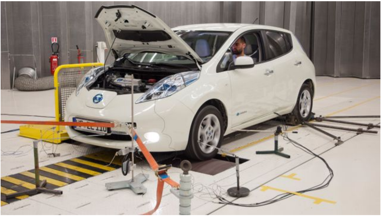
Figure 1. (H)EV Powertrain Testing on Siemens Factory floor

The Objective of this hackathon is to build a robust algorithm to predict and reduce the amount of time required by the engineering parts for testing on the test machines. Candidates will work with a dataset which represents different combinations of part features to predict and optimize the time it takes to pass testing. The second part of the challenge is to build a scheduling tool based on the predicted test time for automated testing and resource planning.